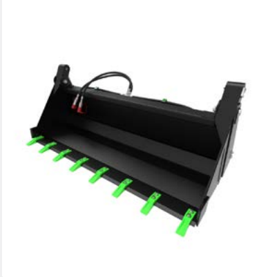
4 in 1 bucket